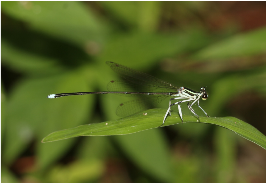
Figure 6. Pseudocoperia ciliata male, photography by C.Y. Choong.