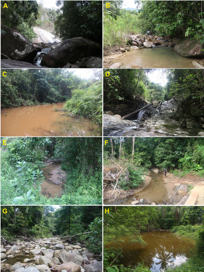
Figure 3. Various sampling habitats. A: location 2, B: location 4, C: location 5, D: location 6, E: location 7, F: location 9, G: location 10 and H: location 11.