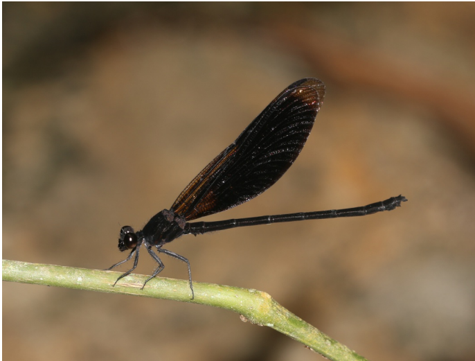
Figure 4. Euphaea masoni male, photography by C.Y. Choong.