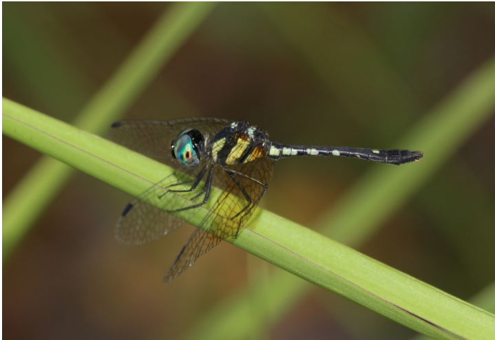
Figure 7. Tetrathemis platyptera male, photography by C.Y. Choong.