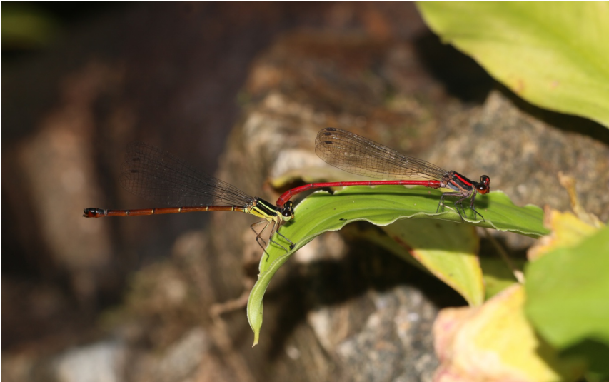
Figure 5. Calicnemia chaseni in tandem pair.

Coeliccia albicauda (Förster in Laidlaw, 1907)