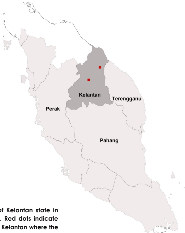
Figure 1. Location of Kelantan state in Peninsular Malaysia. Red dots indicate the general areas of Kelantan where the sampling trips were conducted.

We conducted a short field trip to the central part of Kelantan to collect Odonata on 27 June – 4 July, 2016. The collecting was carried out at Gunung Stong State Park, and the adjacent Gunung Stong Forest Reserves and also at Hutan Lipur Bukit Bakar in the north-east of the state, close to Terengganu. Additionally the second author conducted some limited sampling in Hutan Lipur Jeram Linang, in the same area as Bukit Bakar, on 3 – 4 December 2016; however adverse weather conditions severely limited what could be accomplished. The results from these collecting trips are reported here; the general areas of the state where the sampling was conducted are indicated in Fig. 1. We also compile the published records from Kelantan to produce a checklist of Odonata known from Kelantan.