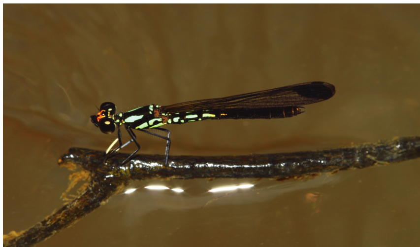
Figure 4. Libellago stigmatizans male, photograph by C.Y. Choong.