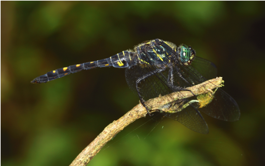
Figure 12. Onychothemis testacea male, photograph by C.Y. Choong.