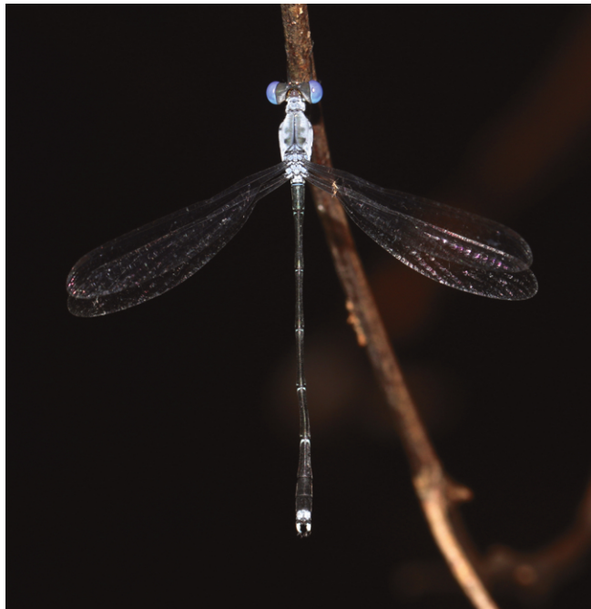
Figure 3. Lestes praecellens male, photograph by C. Y. Choong, taken at location 3.

2 – ♂, 26.viii, RAD. 3 – 2 ♂♂, 25.viii, CYC; 3 ♂♂, 25.viii, RAD; ♂, 26.viii, RAD.