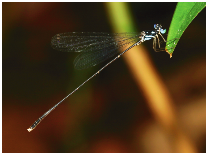
Figure 6. Coelliccia albicauda male, photograph by C.Y. Chong.

7 – 3 ♂♂, ♀, 27.viii, CYC; 2 ♂♂, 27.viii, RAD. 9 – ♂, 29.viii, CYC; ♂, 29.viii, RAD. 11 – ♂, 28.viii, CYC; 3 ♂♂, 28.viii, RAD.