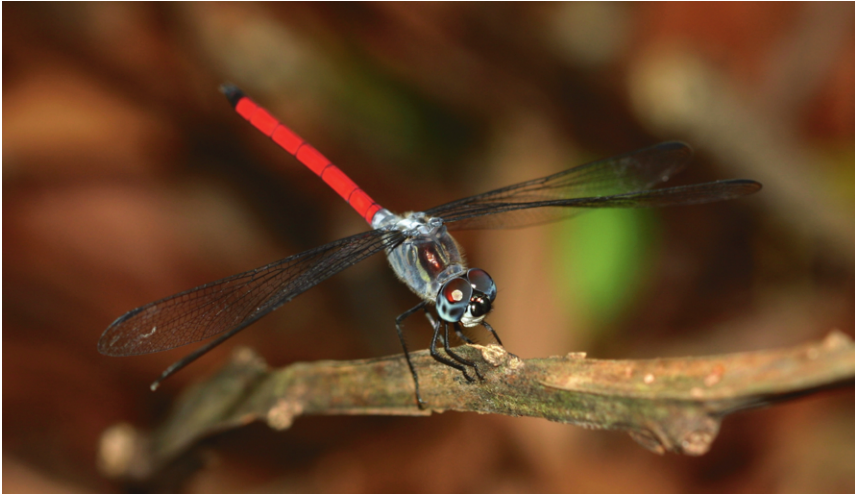
Figure 11. Lathrecista asiatica male, photograph by C.Y. Choong.