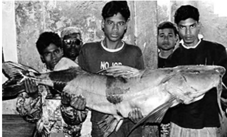
FIGURE 1. Specimen of the Goonch Bagarius yarrelli (Sykes 1839) captured by the local fishermen from the lower part of the Ganges (Padma) River on 3 January 2008.