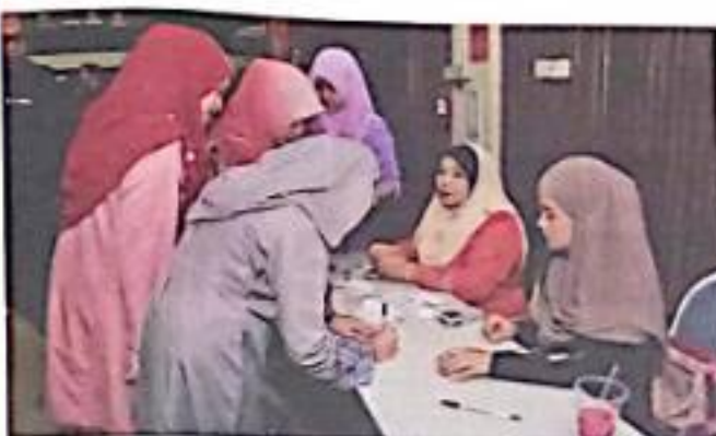
UPSI interns (right) managing the registration desk at an event.

SPECIALISED SKILLS Universiti Malacca Terengganu (UMT) School of Marine and Environmental Sciences (IPPMSE) requires bachelor's degree students from four programmes - Marine Biology, Marine Science, Analytical and Environmental Chemistry, and Biodiversity Conservation and Management - to undergo a 12-week internship at the end of the third or final year (sixth semester). "Generally, during the fifth semester, students attend a series of briefings by the industrial training coordinators which focuses on how to communicate and find placement, write an e-mail or cover letter and attend an interview. They are also reminded about ethics and professionalism."