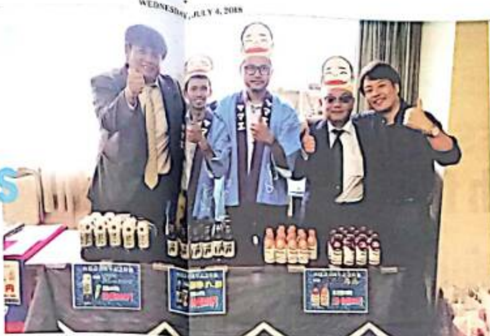
UPM business administration students (second and third from left) on their first day of internship at Yama Food Product Co., Ltd, Japan.