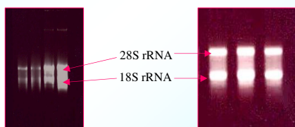
Figure 1: RNA extraction from different methods (A) NTES method (B) Gao et al. method.