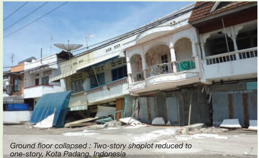
Ground floor collapsed : Two-story shoplot reduced to one-story, Kota Padang, Indonesia

Infrastructure development and communities for most countries have integrated the aspect of reducing risk