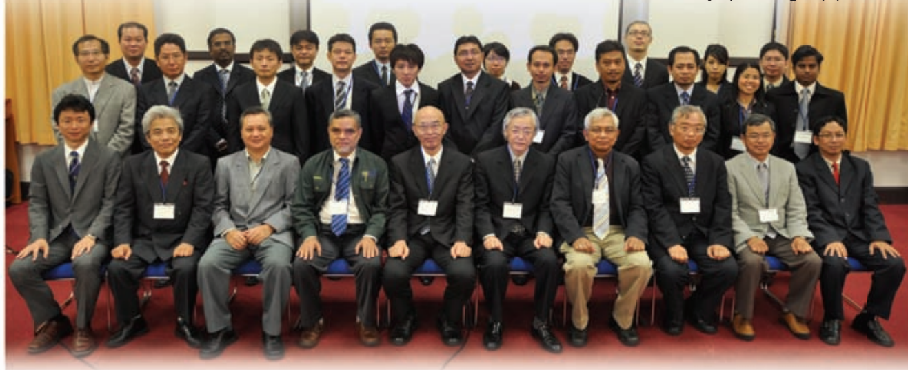
Symposium group photo