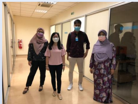
Friendly visit to FFAR by Delightex representatives on 6 th of December 2021.