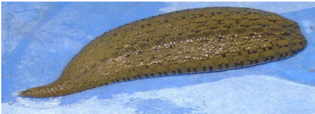
Figure 1: Body of Local Leech (Age: Two Years and Three Months)

Leeches is a sanguivorous (haemopagic), freshwater leech, with a wide distribution in Southeast Asia such as in southern China, the Philippines, Thailand, Vietnam, and Malaysia. In Malaysia, these leeches are known as 'Lintah Kerbau' (406 th Medical Lab. Special Repor, 1968). There has been numerous collection of this species for medical purposes in the 20 th century (Steiner et al. 1990; Electricwala et al. 1993; Singhal & Davies 1996). The Department of Wildlife Protection and National Parks (PERHILITAN) previously operated the leech industry in Malaysia. Since 22 nd of January 2009, the Department of Fisheries Malaysia has taken over the operation of local leech's industry (Department of Fisheries Malaysia 2009). The Fisheries Department have since identified the leech species that can be used for commercial purposes. The taxonomic status of the local leech is as follows: Order: Hirudinea; Species: Hirudinaria manillensis ; Local name: Buffalo leech or "lintah kerbau" (Figure 1).