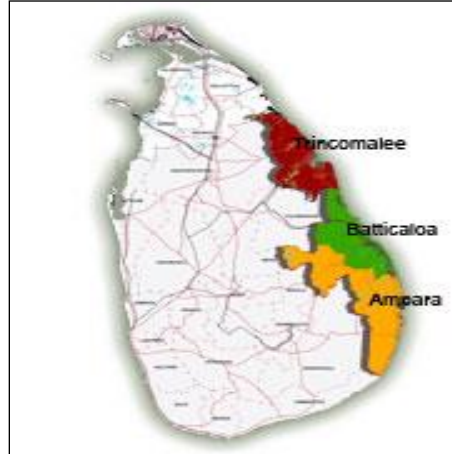
The Map of Eastern Province

Muslims, Tamils and Sinhalese inhabiting the three main districts of Trincomalee, Batticaloa and Ampara. The Muslims are a majority in Trincomalee which also has a significant numbers of Sinhalese closely followed by the Tamils. In Batticaloa, the Tamils and Muslims are dominant. Ampara is Muslim majority district having a sizeable number of the Sinhalese and the Tamils.