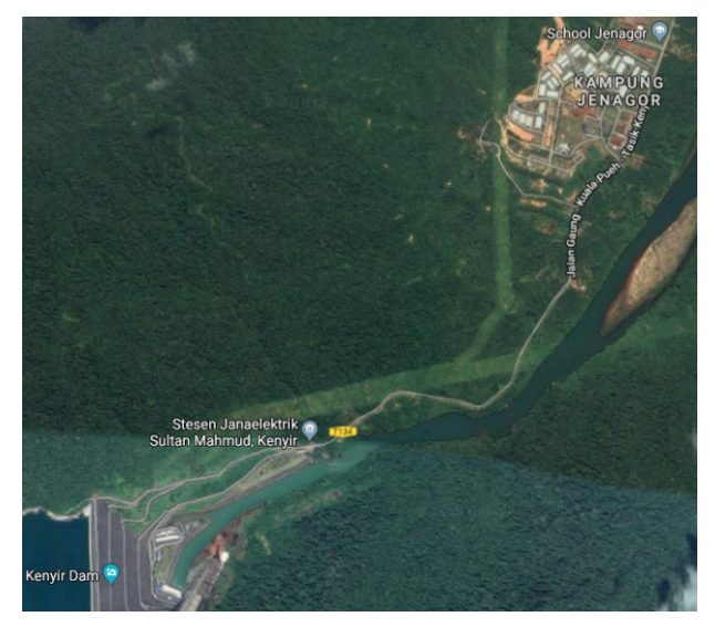
FIGURE 1. Geographical location of Kenyir dam and Kampung Jenagor

Residents in Kampung Jenagor have never experienced any flooding caused by Kenyir dam. Even during the great flood of 2014, water level in Kenyir dam only reached to height level of 148m. Hence, many of its residents felt safe from any flood risks and are not prepared for any flood hazards due to dam disaster.