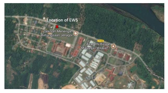
FIGURE 3. Location of EWS in Kampung Jenagor

The two patterns of siren sound are distinguishable by the residents. The warning sound is a wavering siren, swinging back and forth between the low 70 dB and the high 90 dB. The second siren sound is a high pitch danger siren. It is a continuous high pitch 90 dB sound intensity.