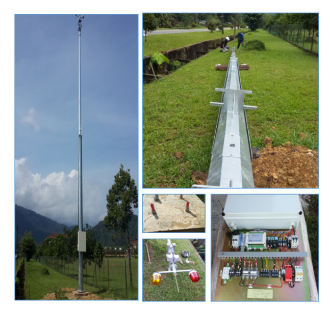
FIGURE 5. EWS installation in Kampung Jenagor