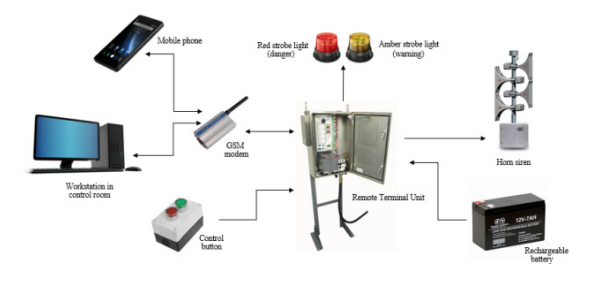
FIGURE 4. Basic architecture of EWS in Kampung Jenagor