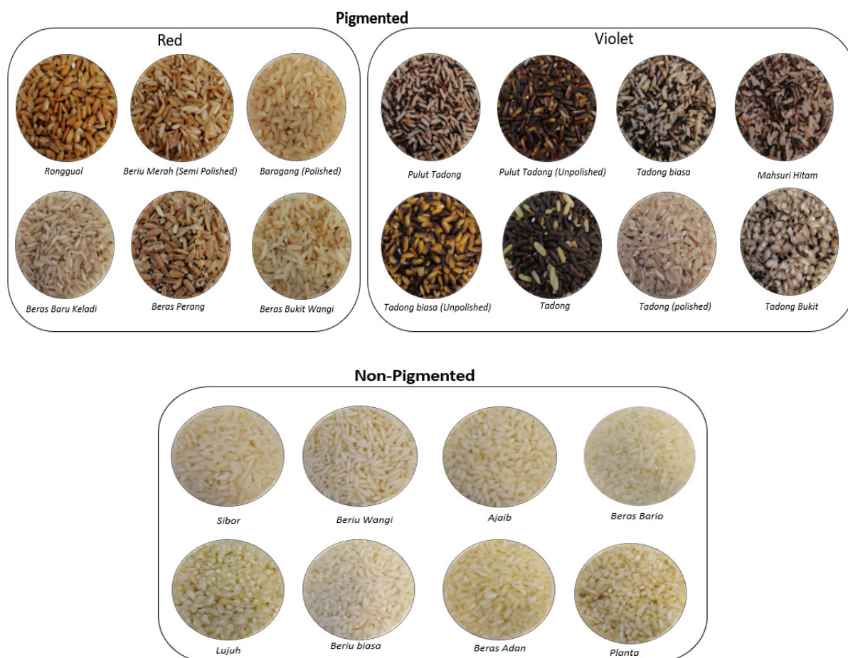
FIGURE 1. Twenty-two Sabah Traditional Rice varieties obtained from the Tenghilan and Tambunan districts in Sabah were divided into non-pigmented and pigmented (red and violet)

tube and subjected to centrifugation at a speed of 7000 rpm at ambient temperature for 10 min. The mixture was subsequently filtered using filter paper and then proceeded to the subsequent experiments.