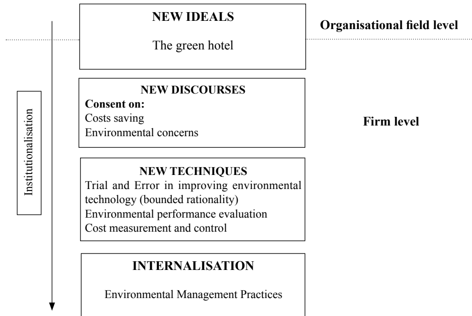
FIGURE 2. The stages of internalisation of environmental management practices

This situation has been explained by Zucker (1987), who noted that actions and processes are often embedded in organisations when the staff's routines and roles are entrenched and have been in use for a long time. As this case demonstrates, the new routines (EMPs) have been introduced and practised by the staff in their daily activities. Eventually, these new routines (EMPs) are universally accepted and institutionalised by the actors (hotel's employees).