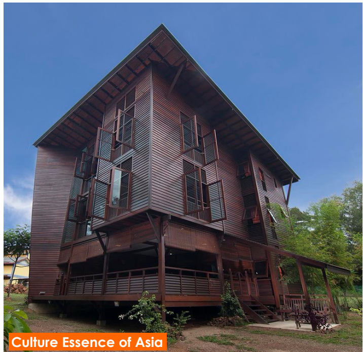
Culture Essence of Asia