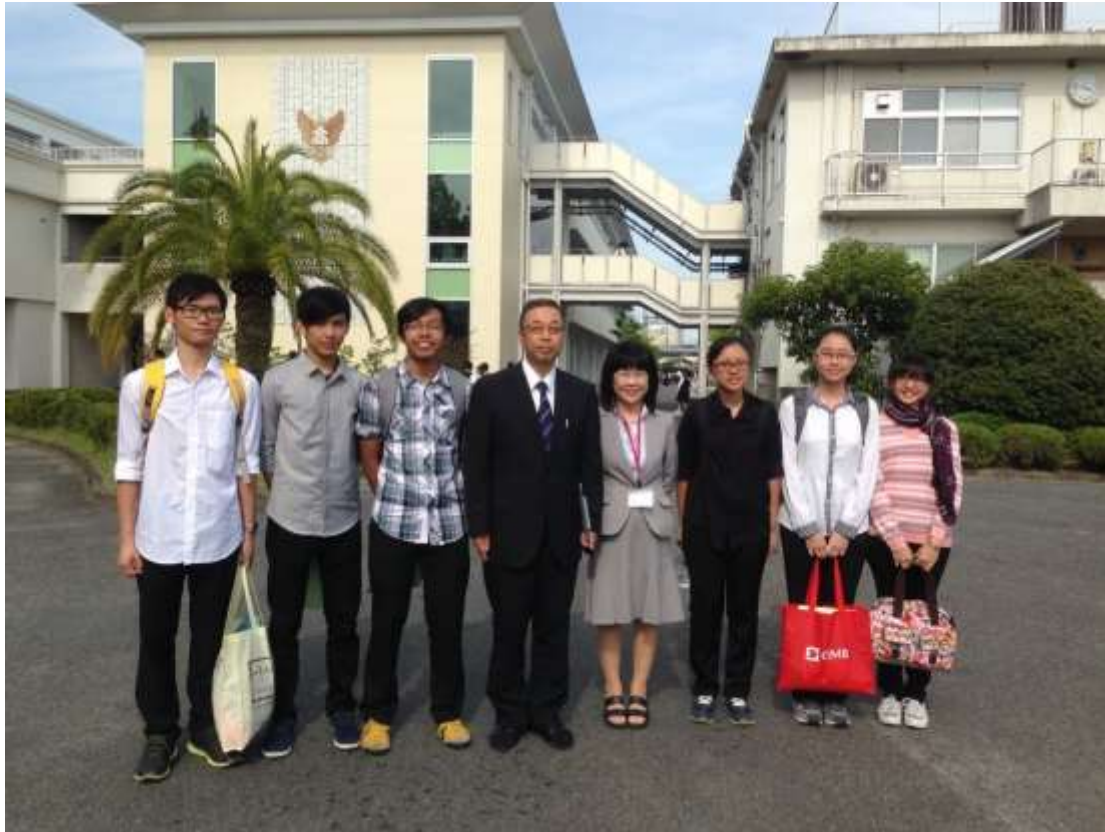
ASASIpintar Students and Instructors of Saga Commercial High School