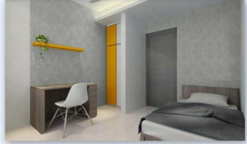
Single Room MYR 680.00 monthly