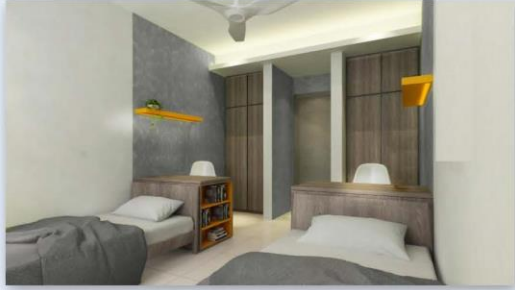
Sharing Room MYR 490.00 monthly/person