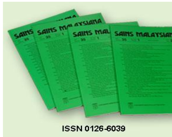
Figure 1. [illustration text and caption should centered, font size 12, included in body text]