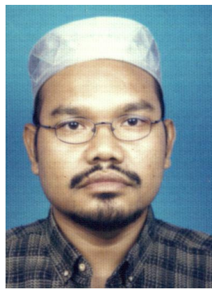
Wearing a skull cap