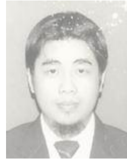
Black and White photo