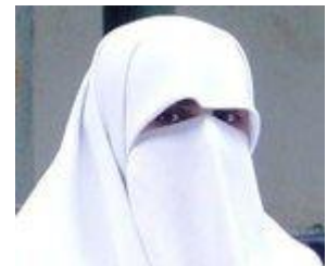
Wearing a veil/ Face covered