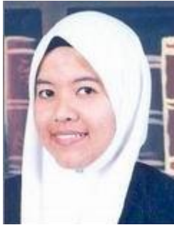
Books in background