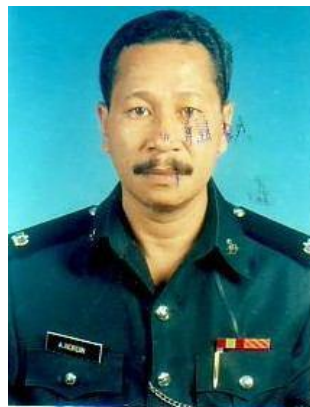
Marks on photo